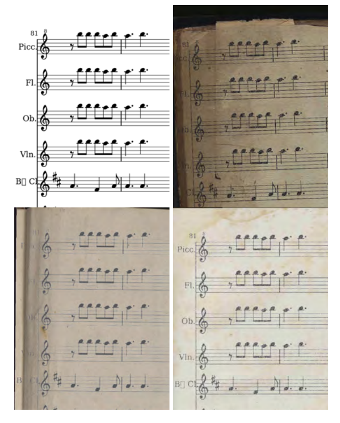
Figure 4: ScoreAug examples (top right, bottom row) derived from the same synthetic sample (top left).

The most common approach to overcome a domain shift is supervised domain adaptation, where densely annotated images are required in the target domain (annotations generally involve instance-level bounding boxes for object detection). Such a solution would require the collection and annotation of a full-scale training dataset consisting of data from the target domain. This approach, therefore, would be tedious and lack the ability to scale, especially for detecting tiny objects in images that are cumbersome to annotate, such as notes in sheet music. Unsupervised