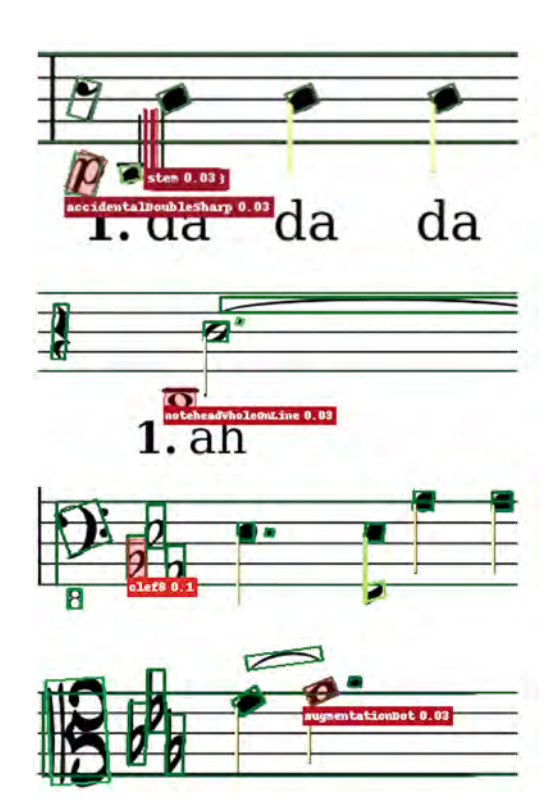
Figure 6: Four cropped visualisation samples of predictions made by an ensemble. The colour of the bounding box indicates the model's confidence (green means high confidence, and red means low confidence). For symbols with a confidence score below 30%, we plot not only the coloured bounding box but also the assigned label as well as the confidence score.