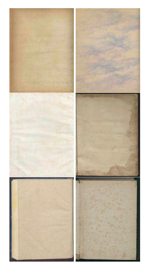
Figure 3: Example blank pages.

In a second step, we sourced a number of "blank" pages from the aforementioned Petrucci Music Library. This was possible because many uploaded music scores would be sourced from completely scanned books, including the front and back covers. Such scans sometimes contain blank pages without any written music, but all the perturbations that naturally occur on sheets of paper. This is a valuable source of real-world noise that can be overlayed with synthetic data. We manually looked through the sourced data