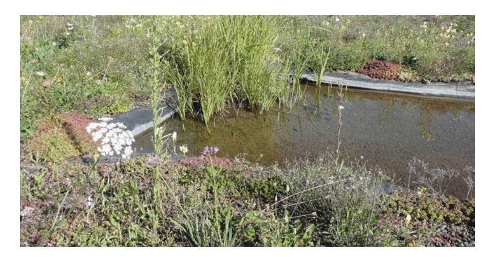
Fig. 2.5 One of the six roofs with a remarkable increase of plant cover following from both sowing and planting carried out between 2008 and 2010. For the first time, in 2010 two young Northern Lapwings, born from two different nesting pairs, fledged from this roof and migrated south.