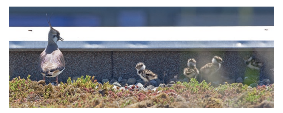
Fig. 2.3 Female Northern Lapwing ( Vanellus vanellus ), with chicks on the extensive green roof in Steinhausen (Hotz AG) with Sedum spp. in foreground.