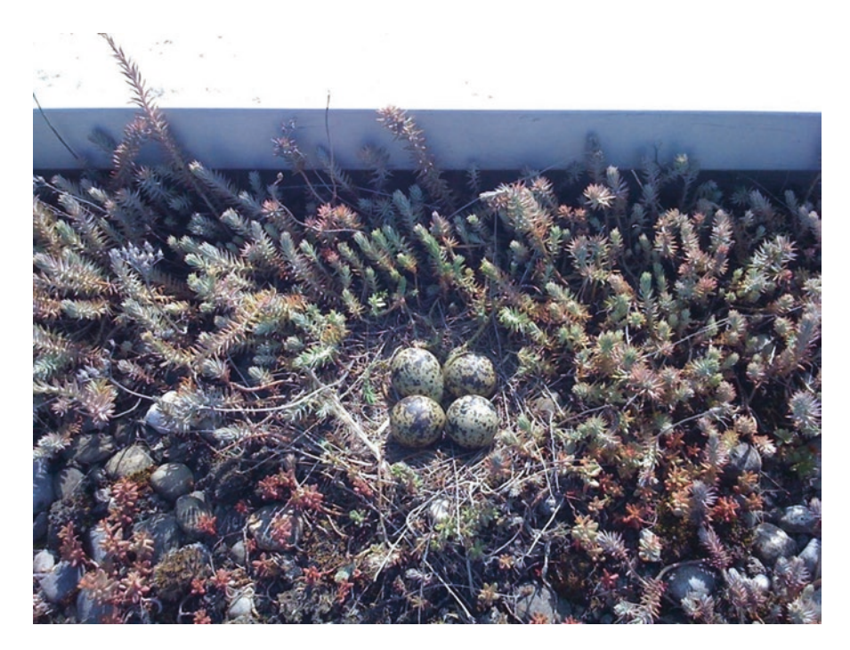
Fig. 2.2 A nest with eggs of the Northern Lapwing on an extensive green roof.