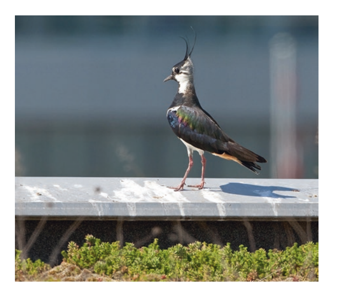
Fig. 2.1 Male Northern Lapwing ( Vanellus vanellus), looking out for predators.

V. vanellus breeds almost exclusively on crop fields and in other low-growing and/or regularly mown or grazed plant communities, such as wet meadows. The first clutch (three to four eggs, Fig. 2.2) is laid in a scrape in the ground. If the first brood is unsuccessful, the adult birds can lay up to seven replacement clutches on a new site or on the same site but several metres away from the first nest. The chicks hatch out after 26–27 days of brooding (Fig. 2.3); they leave the nest early, and after 42 days they are able to fly away. From day one, when they leave the nest, they have to find their food and water by themselves. Food mainly consists of average-sized and not too mobile arthropods, mostly spiders and insects (larvae, nymphs and adults) (https://www.vogelwarte.ch/de/voegel/voegel-der-schweiz/kiebitz, last accessed: 29.05.2020). However, these invertebrate species have been reduced by agricultural intensification (Kooiker and Buckow 1997).