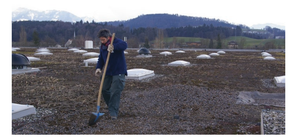
Fig. 2.4 Setup of uneven topography on a green roof. In order to enhance plant and animal (e.g. arthropod) biomass, the environmental conditions of some of the selected roofs were improved by adding a layer 8–16 mm-thick of expanded slate on the pre-existing substrate (30 mm-thick layer of pumice lava and clay) hosting sparse 'moss and Sedum spp.' vegetation.