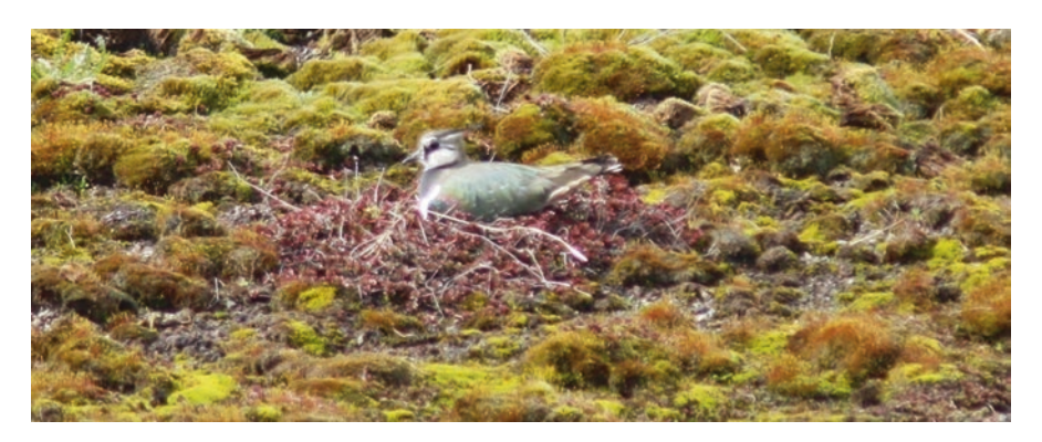
Fig. 2.6 Female Northern Lapwing ( Vanellus vanellus ) nesting on Sedum sp. tussock surrounded by dense moss cover on an extensive roof which had plant cover improved after the first records of nests in order to increase breeding and fledging success.

NPrs nb. of nesting pairs, NClt nb. of clutches, NRClt nb. of replacement clutches, NChk nb. of chicks, NFChk nb. of fledged chicks