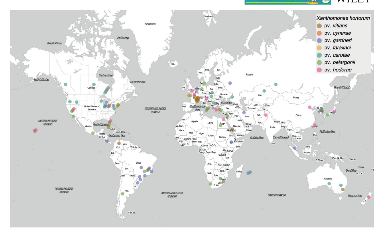
FIGURE 4 Distribution of the seven Xanthomonas hortorum pathovars. Map from the ggmap R package (Kahle et al., 2019) and data adapted from the European and Mediterranean Plant Protection Organization (EPPO). Location is an approximation based on literature available

X. hortorum. For example, bacterial blight of geranium caused by X. hortorum pv. pelargonii is the most devastating bacterial pathogen of geranium and can lead to total geranium loss when environmental conditions are most favourable to this pathogen (Balaž et al., 2016; Manulis et al., 1994; Munnecke, 1954; Nameth et al., 1999). Most carrot seed growers in the Pacific Northwest region of the USA, an important region for US carrot seed production, consider X. hortorum pv. carotae detrimental to seed quality (Dr Jeremiah Dung, The Oregon State University, March 2021, personal communication). In Montreal, Canada, losses due to X. hortorum pv. vitians have led to complete destruction of lettuce fields (Toussaint, 1999). In Florida, USA, the pathovar caused an estimated loss of $4 million from the early to mid-1990s (Robinson et al., 2006), and also caused substantial economic losses in California and Ohio, USA (Carisse et al., 2000; Sahin, 1997). Losses due to X. hortorum pv. gardneri were estimated to cost the Midwestern US tomato-processing industry $7-8 million (Ma, 2015; Ma et al., 2011).